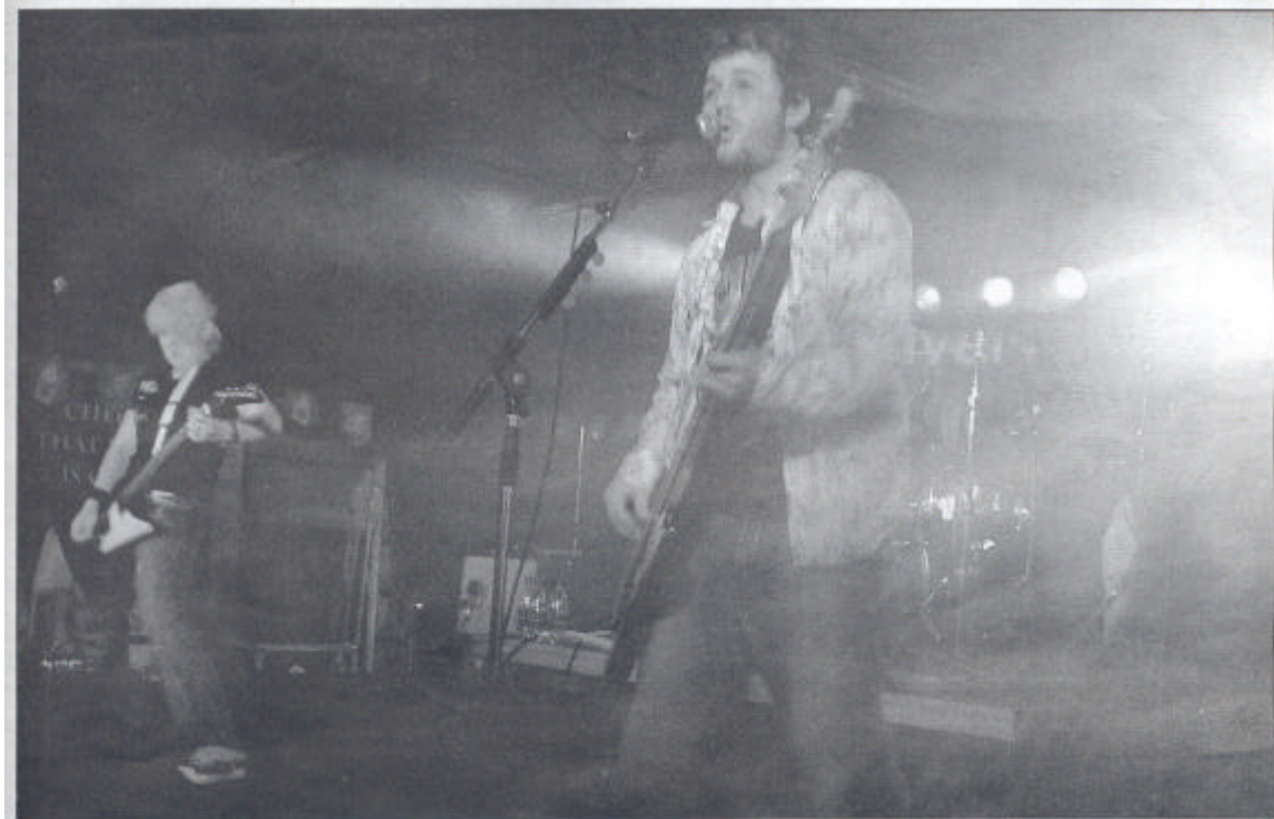
The Joys brought their unique brand of indie power-pop to Oliver's on Oct. 18, putting their reputation as high-energy performers on the line during a free concert.